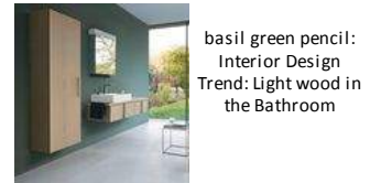
basil green pencil: Interior Design Trend: Light wood in the Bathroom